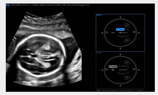
Figure 1. Selection of two seed points