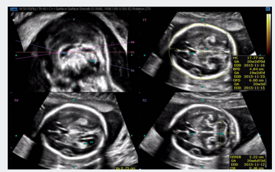
Figure 2. Automated biometric measurements